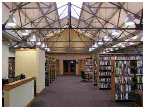
The new Pierre Bottineau Library.

According to Chip Wells of METP, this program operated during the summer of 1999 and was similar to other programs they operated in other neighborhoods in the 1990's. A group of youth worked cleaning