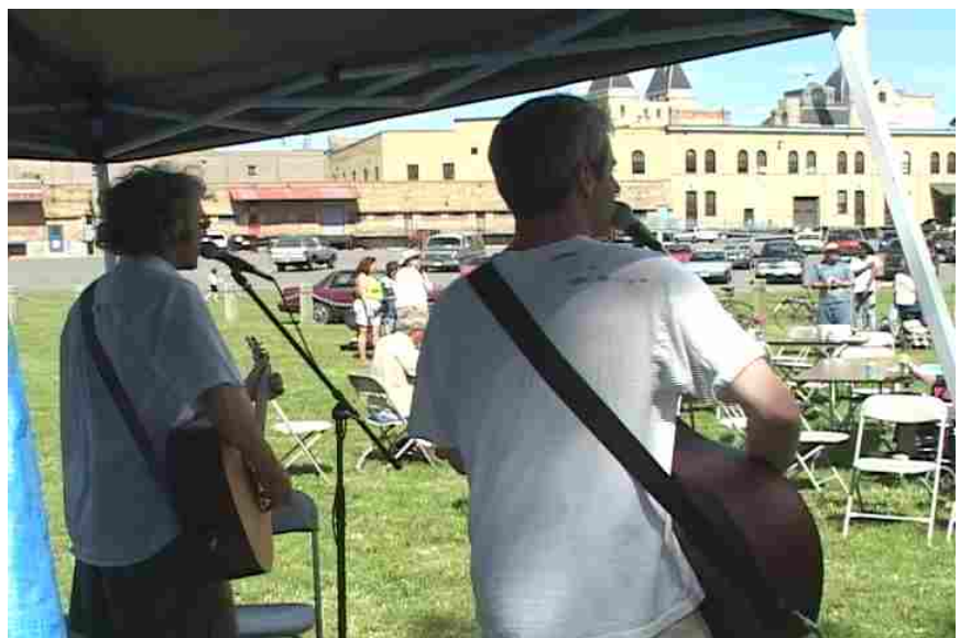
SNO Big Deal Picnic 2003

the neighborhood NRP plan. A town meeting was held in June 2003 to review the Phase I plan and take comments on it. Surveys were passed out and neighborhood comments about the plan's projects were solicited. The review was then written by several contributors and collected into this document. Additional information was gathered from surveys sent out by the Housing Resource Center, the organization that administers Sheridan's loan programs.