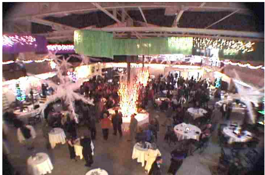
SNO Ball 2004