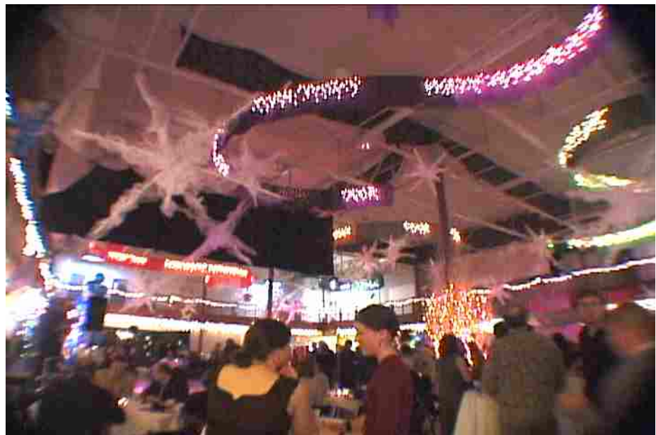
SNO Ball 2004 at the Grain Belt Bottling House

Additional funds helped to pay for a Marshall Street study and plan. This effort plans for the future of this shared street near the river. This plan was developed under the guidance of MEND.