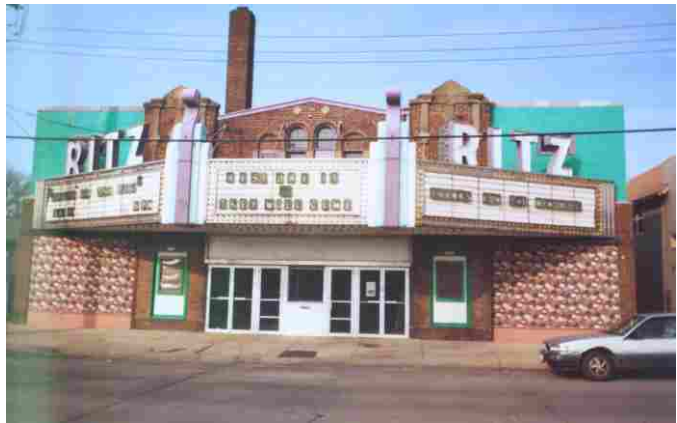
The Ritz Theatre waits for a new life.

These initial funds were used by BOD for pre-development work. The funds were used by a BOD consultant, Sutton and Associates, to pay for a parking study and plan, a budget and databases for the project, and architectural plans, among other uses. In 2003, neighborhood residents voted to reallocate an additional $80,000 to fund the first stages of capital improvements to the theatre building. These funds will be used to stabilize the structure. In the meantime, BOD has already raised