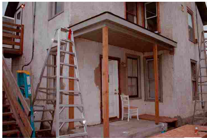
Fix and Paint: Before

Each year that it has run, this program has received about three