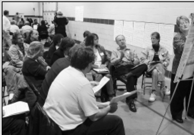
Ninety-three people representing 53 NRP neighborhood groups took part in a citizen participation focus group on October 13. See front page for more details.